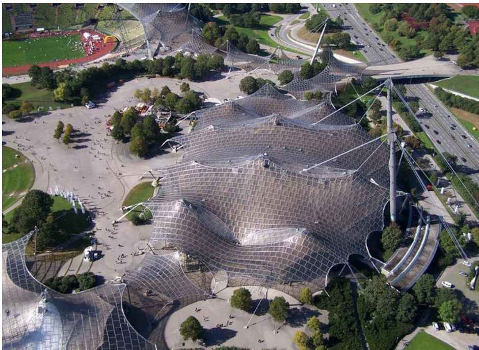
Google's California Headquarters in Mountain View, BIG architects and Heatherwick Design Version 1, 2014.