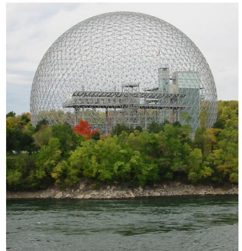
Biosphère for the Expo 67 in Montreal by Richard Buckminster Fuller.