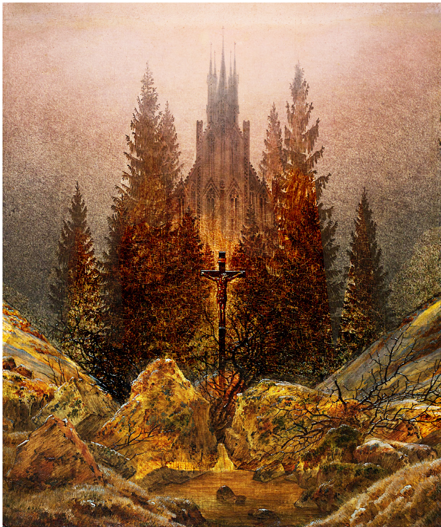
The Cross in the Mountains, 1812, Caspar David Friedrich, Museum Kunstpalast, Düsseldorf