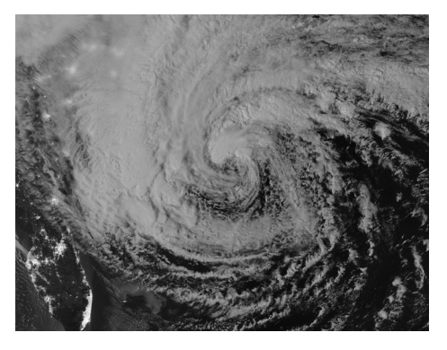
Hurricane Sandy over Georgia and Florida.

Water is probably the single most determining factor in each and every landscape of the globe. Since the most ancient times, it has been channelled and used for cities and irrigation. Today, entire environments must be rethought. We have become the "preparators" of a natural world that has been depleted, and in terms of resilience and sustainability, this will require a fuller understanding of the forces at play. Whether we have learned the lessons of environmental deterioration remains unclear, but in order to buffer environmental degradation a new kind of relationship to nature must be invented from scratch. Whether through excess of drought or flood, water has become the principle factor that changes environments. A series of examples show a portrait of the effects of change presently underway. From the dessicated Salton Sea that was created in 1906 as one of