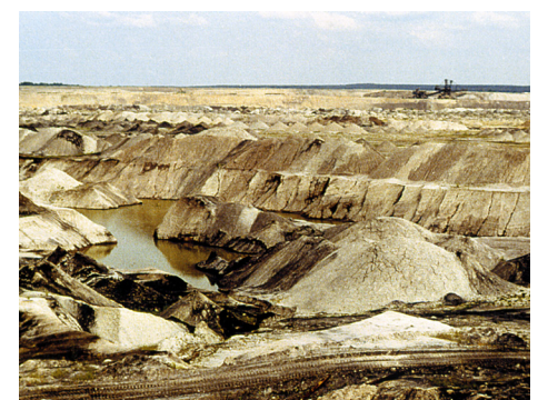
Lignite opencast mine, Niederlausitz/Germany.