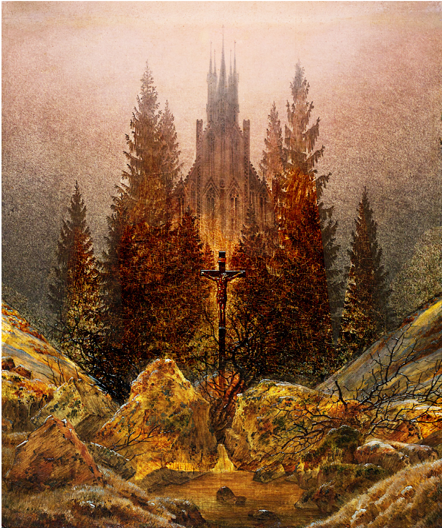
The Cross in the Mountains, 1812, Caspar David Friedrich, Museum Kunstpalast, Düsseldorf