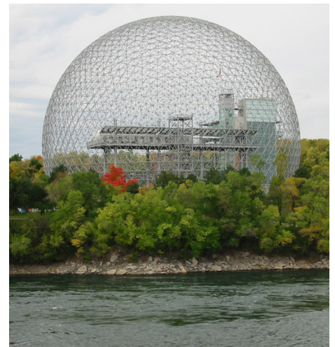
Biosphère for the Expo 67 in Montreal by Richard Buckminster Fuller.