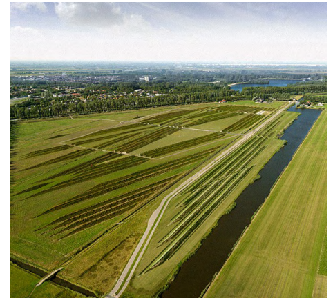
Park Buitenschot, Schiphol Airport, Amsterdam H.N.S. Landscape Architects