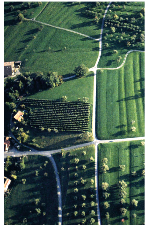
"Hochacker" in Hagenwil/Switzerland