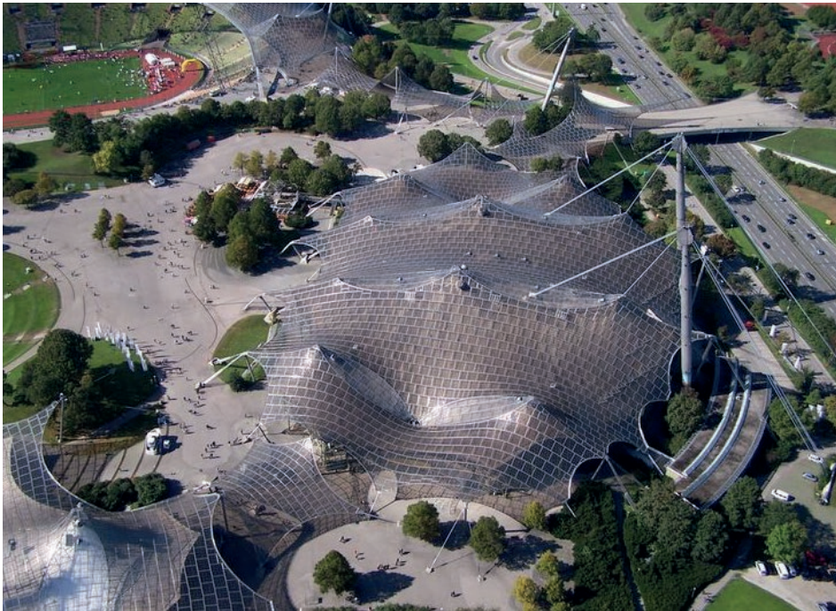
Google's California Headquarters in Mountain View, BIG architects and Heatherwick Design Version 1, 2014.